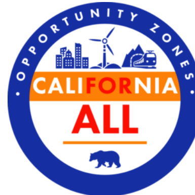
OPPORTUNITY ZONES & PLACE-BASED