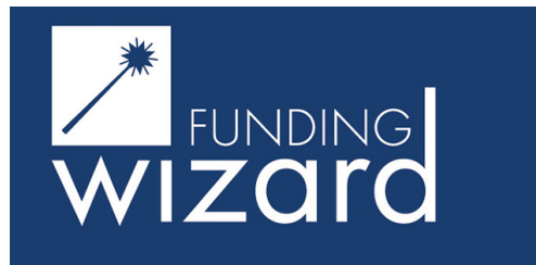
CARB FUNDING WIZARD